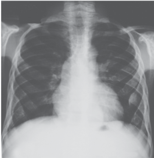
Fig. 3: Gross expansion noted in the ribs due to marrow hyperplasia.