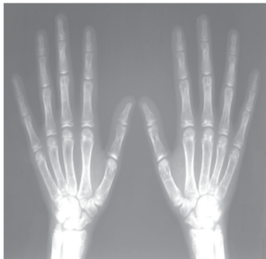
Fig. 4: Gross marrow hyperplasia has expanded and thinned the overlying cortical bone.