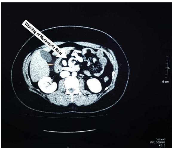
Figure 3: A transverse view of CT abdomen showing whirling of mesenteric root in 35 years old women with intestinal malrotation.