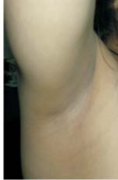
Fig-4: Absence of axillary hair