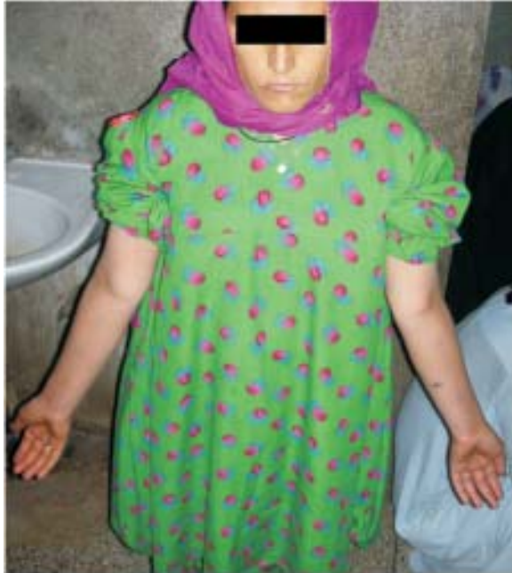
Fig-1: Short stature with cubitus valgus.