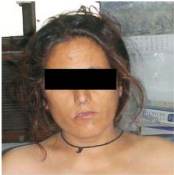
Fig-2: Webbing of the neck.