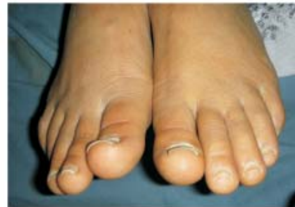
Fig-6: Short 4 th and 5 th metatarsals.

amenorrhea or suggestive phenotypic features had Turner's syndrome. 14 Karyotyping is indicated for girls with unexplained short stature (more than two standard deviations below the mean height for age). 12,13