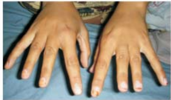
Fig-5: Short 3 rd and 4 th metacarpals.