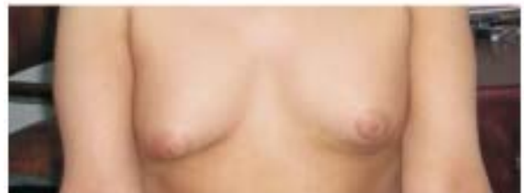
Fig-3: Broad chest with poorly developed breasts & widely spaced nipples.